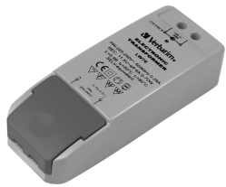
143820 LED Transformer 12V AC 0-45W DIM LED lamp