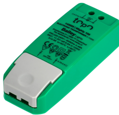
145685 TOPO Mighty Transformer 12V AC 0-105W / LED 0-70W DIM