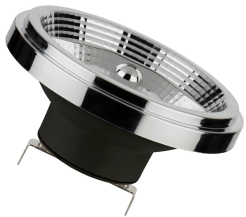
145703 LED Spot ES111 G53 12V DIM 9W (75W) 620lm 927 24° Bridge