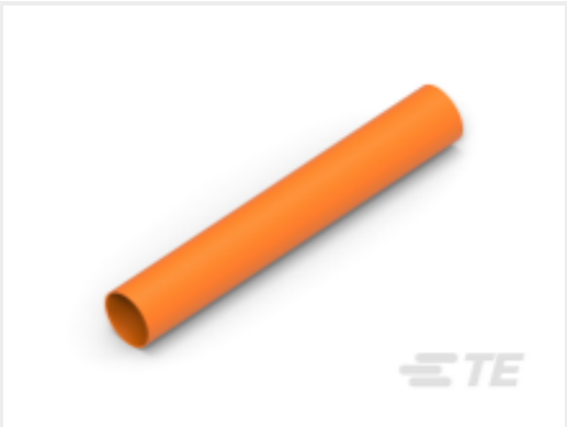
TE Part #CAT-HST-ATUM1 ATUM 4:1 Heat Shrink Tubing