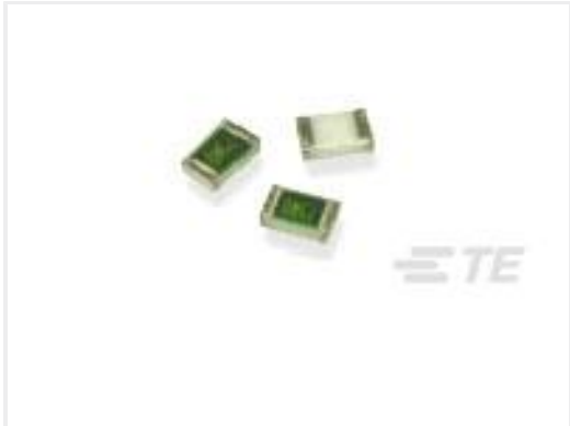
TE Part #7-2176088-0 RP 1J 0.166W 4K75 0.1% 25PPM 1K RL