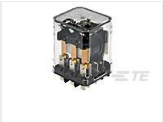
TE Part #5-1393117-5 KUP-11D55-110=KU