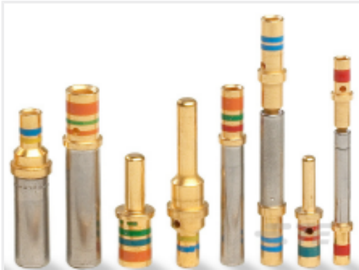
TE Part #2562-201-2031L CONT SOC ASSY