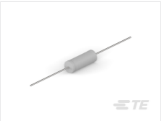
TE Part #8-2176412-7 5W XSM M/OX 5% 20K