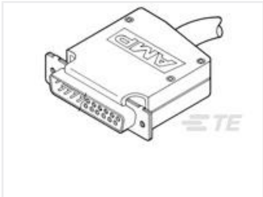
TE Part #5205732-1 CLAMSHELL ASSEMBLY,SIZE 5