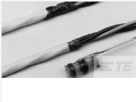
TE Part #139321-000 SO96-1-00