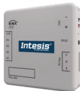
Fujitsu to KNX - 1 indoor unit

The Fujitsu-KNX interface allows full bidirectional communication between Fujitsu RAC and VRF units and KNX installations. It has four potential-free binary inputs to integrate external devices (such as window contacts or presence detectors), with the corresponding internal functions available to help improve energy efficiency.