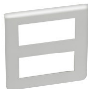
PLATE MOSAIC - 2 X 5 MODULES - ALU