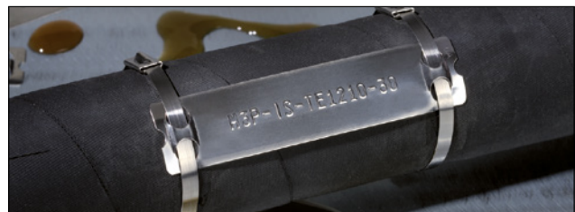
Identification for hazardous environments: M-BOSS Lite stainless steel markers.