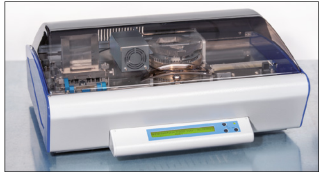
Space-saving and easy to use: M-BOSS Lite stainless steel embossing system.