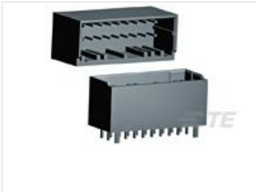
TE Part #2-1871935-1 DYNAMIC 1900D HDR ASSY H-TYPE 22p