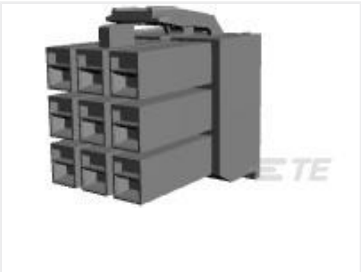
TE Part #176276-1 AMP UNIVERSAL POWER PLUG 9P