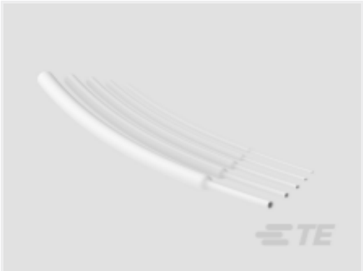
TE Part #NB13742001 RNF-100-3/8-WH-STK