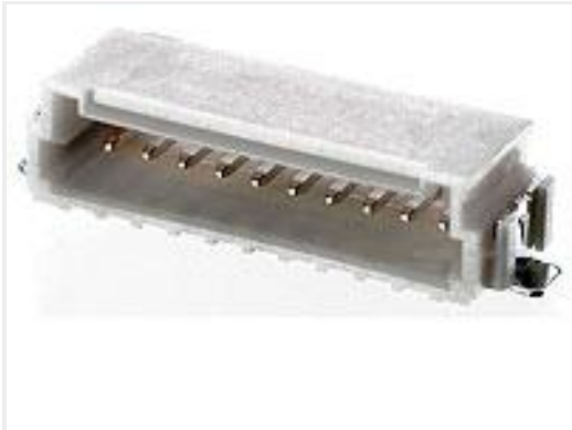
TE Part #292228-6 1.5 MINI CT SGL H SMT W/O BOSS