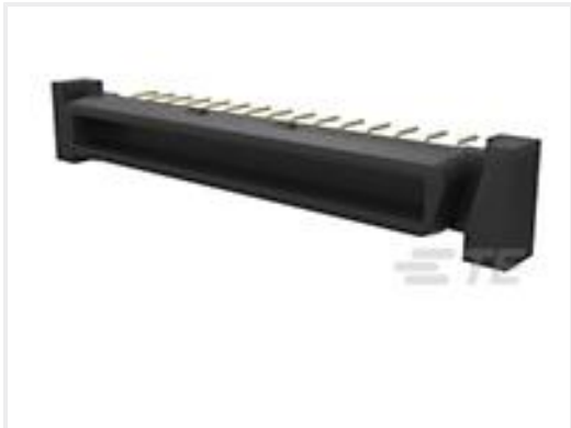
TE Part #5917628-5 REC ASS'Y(V) 120P 1.27FHBB