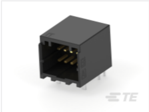
TE Part #CAT-D9934-A15E Header Assembly: Wire-to-Board, 3A, Gold or Tin Plated