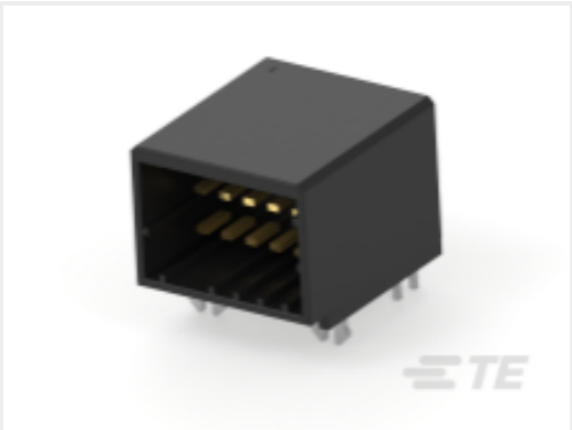
TE Part #CAT-D9934-A66B DYNAMIC 2000 HDR ASSY