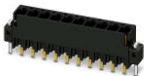
The illustration shows the 10-position version

Header, Nominal current: 6 A, Rated voltage (III/2): 160 V, Number of positions: 2, Pitch: 2.54 mm, Color: black, Contact surface: Gold, Mounting: Taped SMD/THT/THR components, Fixed coding of the first position, can be combined with the FMC 0,5/...-ST-2,54 C1 connector