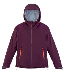
■ 1783 PURPLE