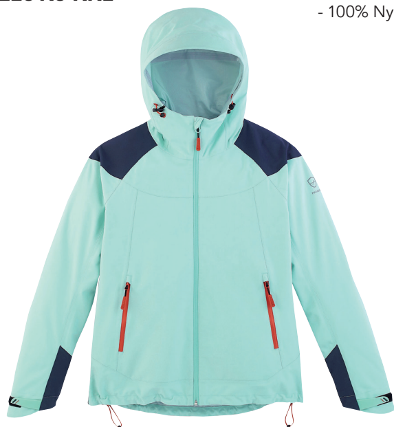
■ 1718 ICE GREEN