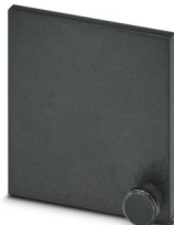
Dummy plate for unused slots on instrument housings

Please be informed that the data shown in this PDF document is generated from our online catalog. Please find the complete data in the user documentation. Our general terms of use for downloads are valid.