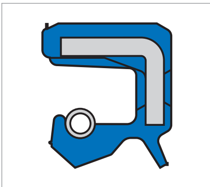
Simmerring BA ...SL