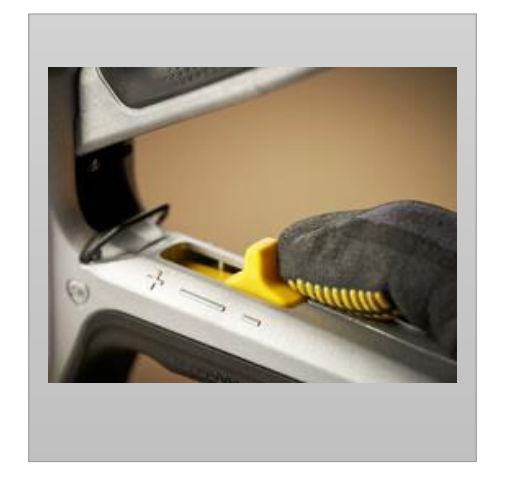
HIGH-LOW POWER SETTING

Keeps stapler at correct angle for optimum pressure on the nose