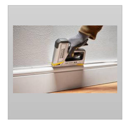
SUITABLE FOR A VARIETY OF PROFESSIONAL APPLICATIONS

Ideal for securing alarm cabling to skirting, and architrave and telephone cables to stud work.