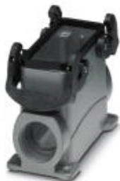
HEAVYCON box mounting base B16, with double locking latch, height 84 mm, with support 1xM32

Please be informed that the data shown in this PDF Document is generated from our Online Catalog. Please find the complete data in the user's documentation. Our General Terms of Use for Downloads are valid ( http://phoenixcontact.com/download )