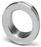
Reducing adapter, metal, M32 to M25, including O-ring

Reducing adapter - REDUC-M-KV-M32/M25 - 1647637