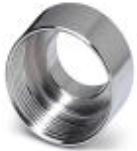
Step-up adapter, M32 to M40, including O-ring

Extension adapter - ENLAR-M-KV-M32/M40 - 1647682