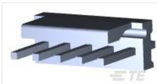
TE Part #3-641208-5 05P MTA156 HDR ASSY FL ST LF