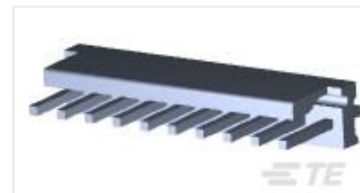
TE Part #4-641208-0 10P MTA156 HDR ASSY FL ST LF