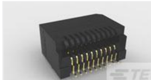
TE Part #1367073-2 20 POS SMT CONN, SFP, 30AU