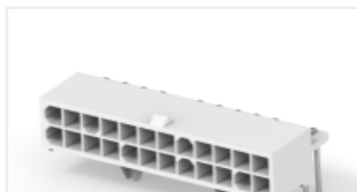
TE Part #1586746-2 24P MINI UMNL R/A HDR LF OMIT