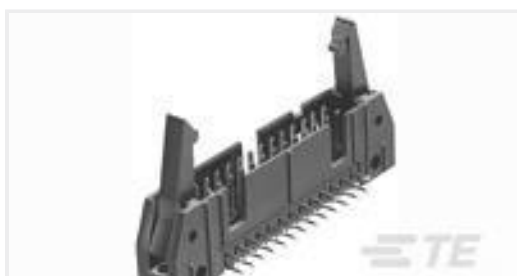
TE Part #2-5499345-6 A/L UNIV HDR 26P RA SHT LAT BL