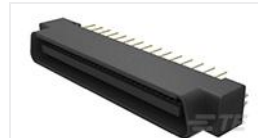
TE Part #1734100-5 Champ050 series, 50pos, Au over PdNi