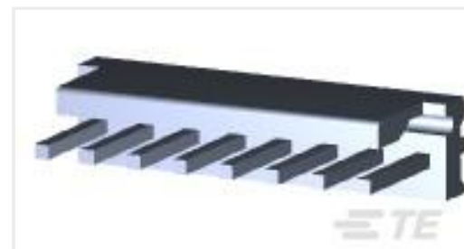
TE Part #3-641208-8 08P MTA156 HDR ASSY FL ST LF