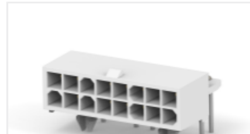
TE Part #1586821-2 16P MINI UMNL RA HDR ASY OMIT