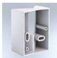
Optional corner wall mount bracket