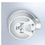
4 digital pyros

The compact designer motion detector. The sensIQ S gives a look that architects appreciate. It was developed specifically for wall mounting. Being altogether more compact than big brother sensIQ, the sensIQ S nestles up against the facade, perfectly harmonising with modern, purist architecture. With IP54 rating and class II protection, it can stand any amount of wind and weather. Its inner values are spectacular too because it comes with the same highly intelligent features and setting options as the larger sensIQ: it has a coverage angle of 300°. The detection reach of the four pyro sensors can easily be scaled from 2 to 20 m (tangentially, temperature-stabilised) in three directions using control dials – instead of shrouds of the type normally used on most other motion detectors. A corner wall mount is available as an accessory. The remote control is included for you to make your own personal settings the convenient way.