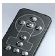
Remote control RC1 included