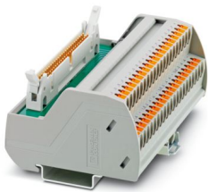
VARIOFACE interface module, with push-in connection, for 32 channels

https://www.phoenixcontact.com/in/products/2903803