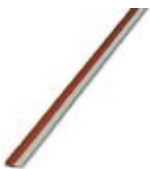
Continuous plug-in bridge, length: 500 mm, color: red

Continuous plug-in bridge - FBST 500-PLC RD - 2966786