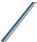
Continuous plug-in bridge, length: 500 mm, color: blue

Continuous plug-in bridge - FBST 500-PLC BU - 2966692