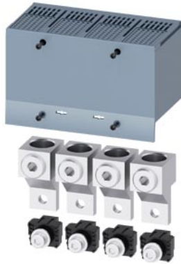
Wire connector TA2.2 50...240 mm 2 large 4 units accessories for: 3VA2 100/160/250