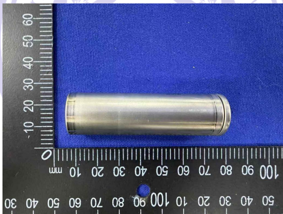
Photo 4 Internal Cell 内部电芯