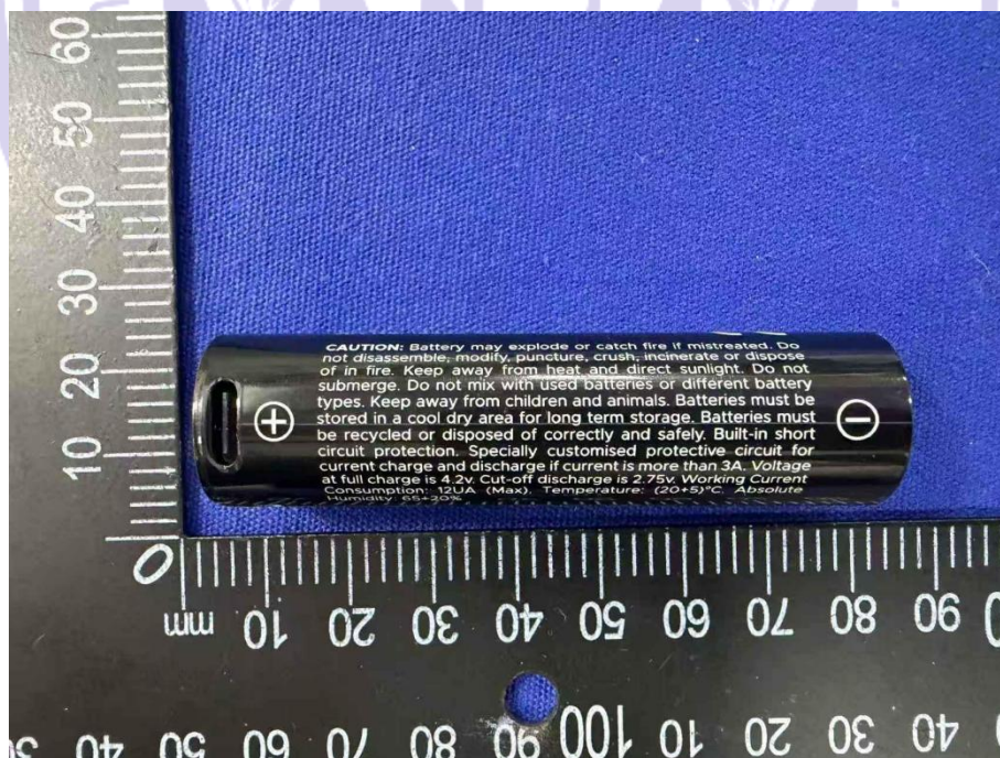
Photo 2 Rear 反面