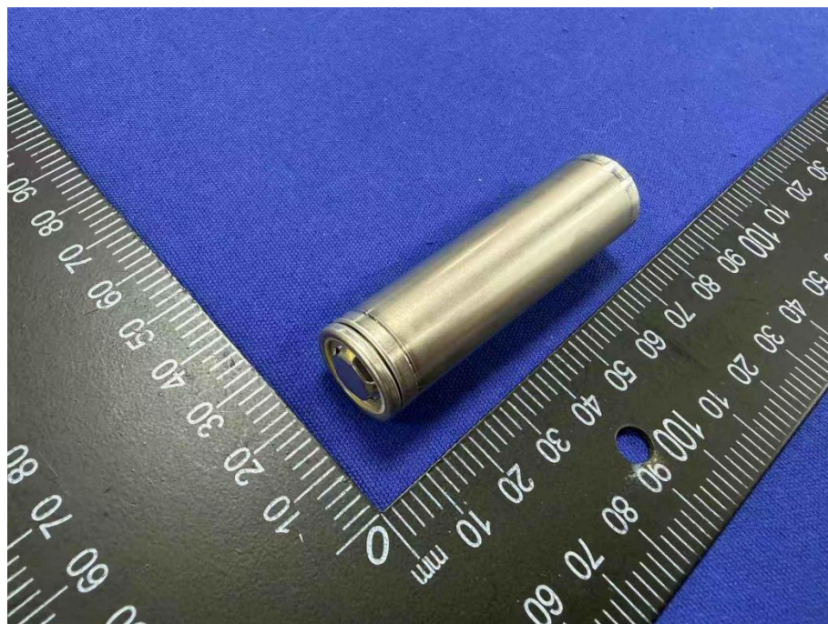
Photo 3 Internal Cell 内部电芯