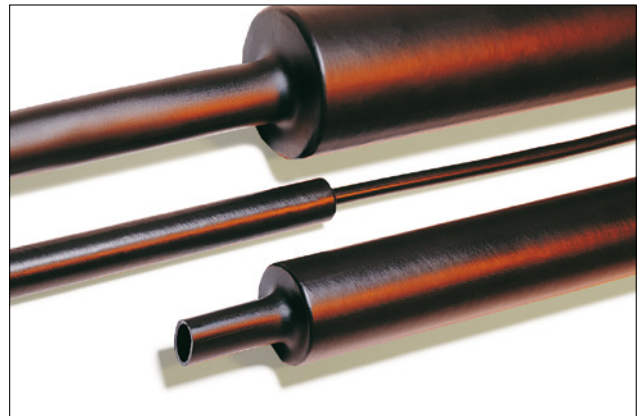
MA47 and MU47 medium wall tubing - lined and unlined.

Cut lengths available on request. Please contact us!