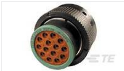
TE Part #HDP26-18-14PN PLG, 14P, BLK, N, 16, P