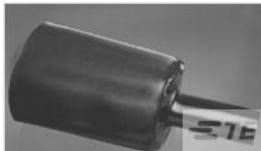
TE Part #CX7208-000 RHW-12/3-1200/ADH-0