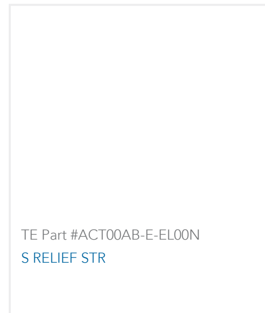
TE Part #ACT00AB-E-EL00N S RELIEF STR