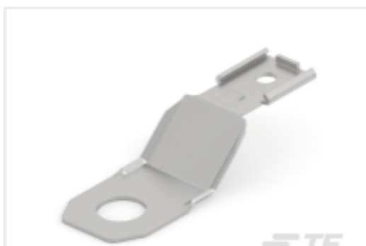
TE Part #1027-014-0800 CLIP, STEEL, ZINC, 8.2MM HOLE, ST, DT8PIN