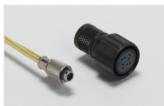
Standard Circular Connectors(9156)