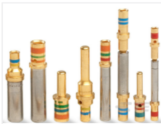
TE Part #ZPF000000000121739 182-0862-22