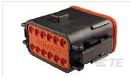
TE Part #DT06-12SB-B016 PLG, 12P, BLK, N, ENH KEY, B