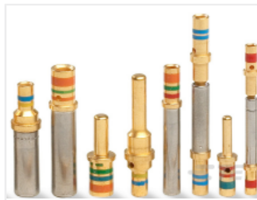
TE Part #38946-22L CONT SOC ASSY