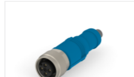
TE Part #T4151320004-005 RPC-M12-FS-4CON-PUR-5.0