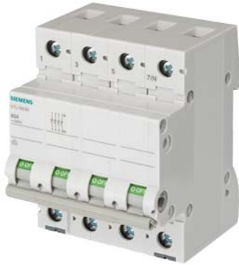
off switch 32A 3-pole+N