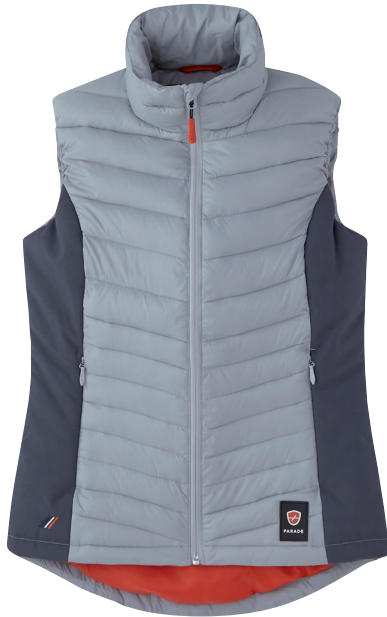
■ 1713 GREY