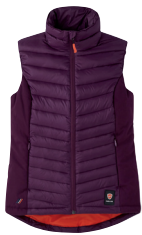
■ 1783 PURPLE