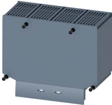
terminal cover offset for plug-in and draw-out socket accessory for: circuit breaker, 4-pole 3VA1 100/160