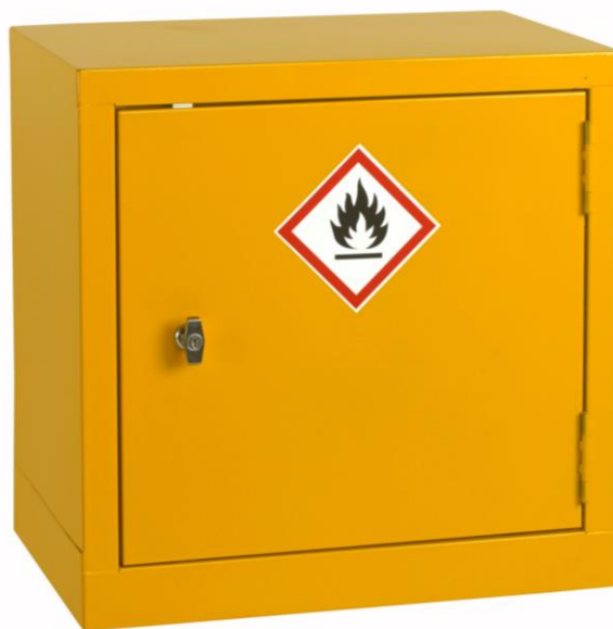
Cabinet Size: H457 x W457 x D305mm