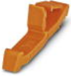
Latching, Color: orange