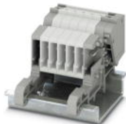
COMBI receptacle, Connection method: Push-in connection, Number of positions: 3, Cross section: 0.14 mm 2 - 1.5 mm 2 , AWG: 26 - 14, Width: 10.5 mm, Height: 27.1 mm, Color: gray/blue/green-yellow

Please be informed that the data shown in this PDF Document is generated from our Online Catalog. Please find the complete data in the user's documentation. Our General Terms of Use for Downloads are valid ( http://phoenixcontact.com/download )