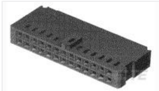
TE Part #102387-5 24 MODIV HSG COMP DR .100 POL