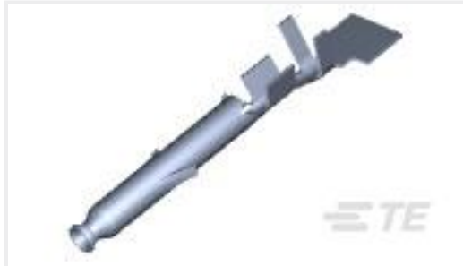
TE Part #770902-1 MINI UMNL SOCK 26-22 AWG SN