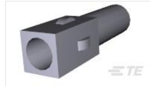
TE Part #1-350867-0 01P UMNL PLUG HSG NATL