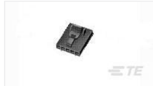
TE Part #104257-6 07 MTE RCPT HSG SR LATCH .100