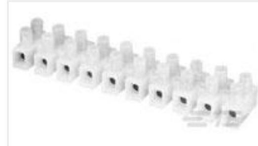
TE Part #1776302-1 TSB100001DS=EUROPA TM BLK, 12MM