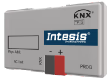
Mitsubishi Electric Domestic to KNX - 1 indoor unit

The Mitsubishi Electric-KNX interface allows full bidirectional communication between Mitsubishi Electric domestic, Mr. Slim, and City Multi air conditioner units and KNX installations. It connects directly to the indoor unit and delivers complete interoperability with KNX.