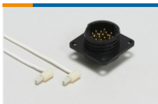
Circular Power Connectors (10)