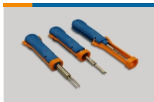
Insertion & Extraction Tools (2)