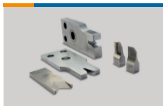
Spare & Wear Tooling(1)