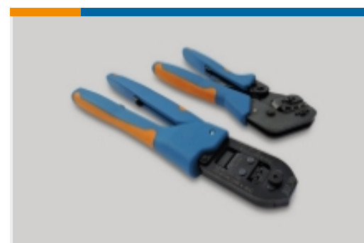
Portable Crimp Tools(4)