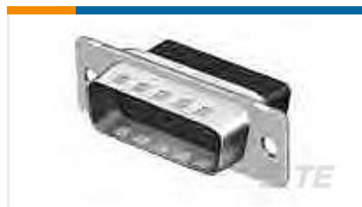
TE Part #5205208-1 CRIMP SNAP PLUG ASSY, 25 POS