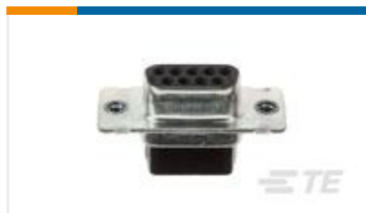
TE Part #1658643-1 HDP-20,RCPT,SIZE 1, 9 POSN,CLI