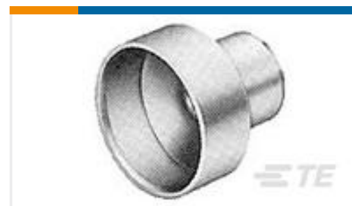
TE Part #3-747579-4 SHLDNG FERRULE, PLTD, BULK PKG