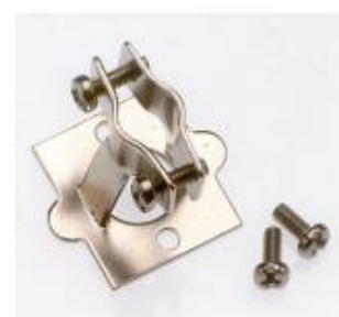
Standard (Duplex) Clamp