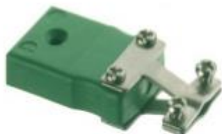
Miniature clamp when fitted