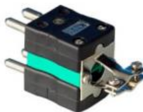
Standard Duplex clamp when fitted