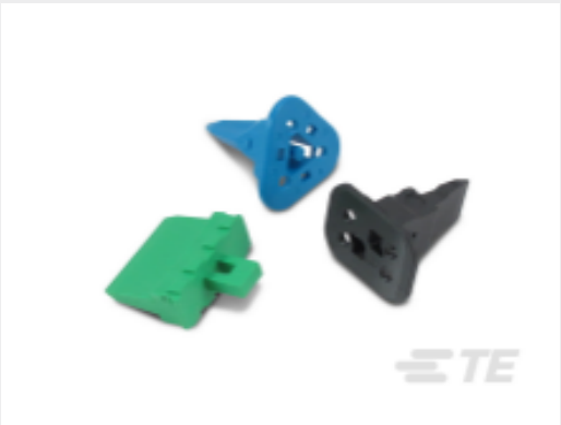
TE Part #CAT-D487-W416 WedgeLocks: DEUTSCH DT