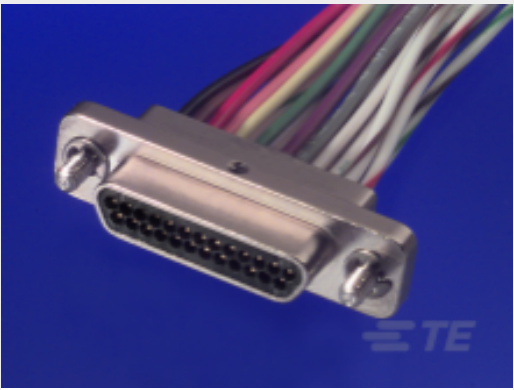
TE Part # 2-1532171-6 M83513/04-A10C, MCKS-C2-B-9S6Q1-36.0