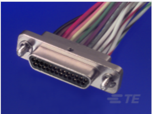
TE Part # 2-1532171-1 M83513/04-A05C, MCKS-C2-B-9S5L4-0.5