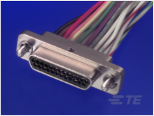
TE Part # 3-1532172-0 M83513/04-B14C, MCKS-C2-B-15S6G9-72.0