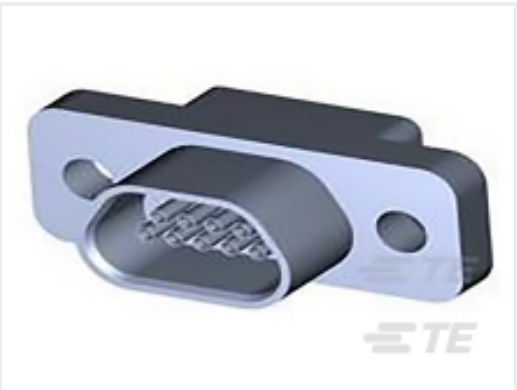
TE Part # 1532188-2 M83513/02-BC, MCKS-C2-B-15SS