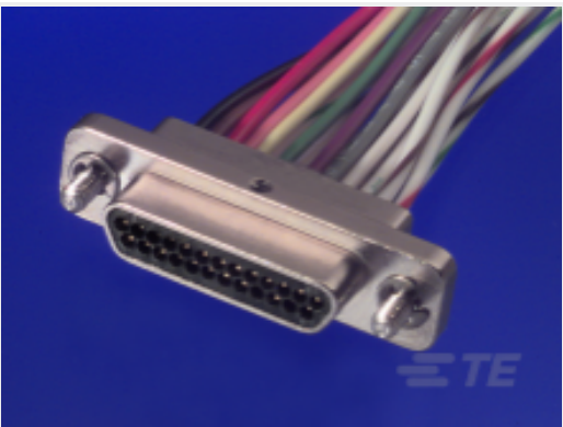
TE Part # 2-1532171-5 M83513/04-A09C, MCKS-C2-B-9S6Q1-18.0