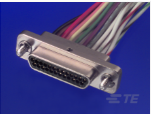
TE Part # 2-1532171-9 M83513/04-A13C, MCKS-C2-B-9S6G1-72.0