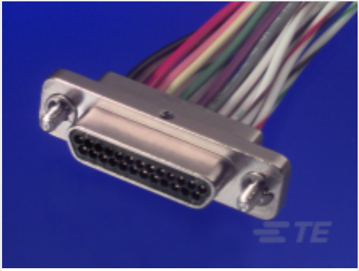
TE Part # 3-1532171-2 M83513/04-A16C, MCKS-C2-B-9S6Q9-72.0