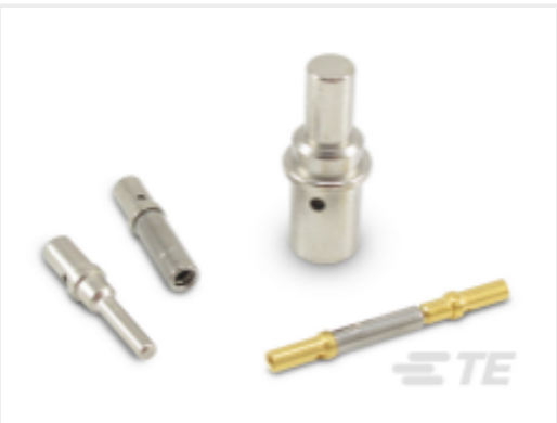
TE Part #CAT-D48-ST273 DEUTSCH Solid Contacts