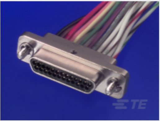
TE Part # 2-1532171-4 M83513/04-A08C, MCKS-C2-B-9S5L5-1.0