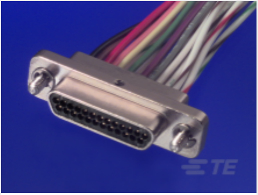
TE Part # 2-1532171-8 M83513/04-A12C, MCKS-C2-B-9S6Q9-36.0