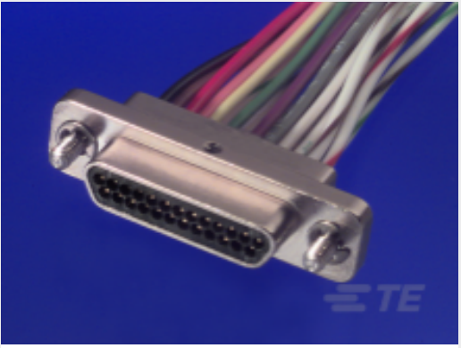
TE Part # 2-1532172-0 M83513/04-B04C, MCKS-C2-B-15S6G9-36.0