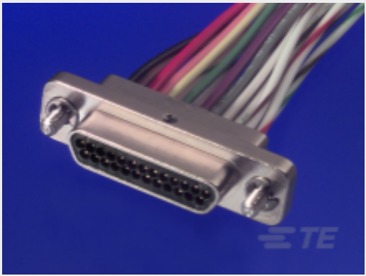
TE Part # 2-1532171-7 M83513/04-A11C, MCKS-C2-B-9S6Q9-18.0