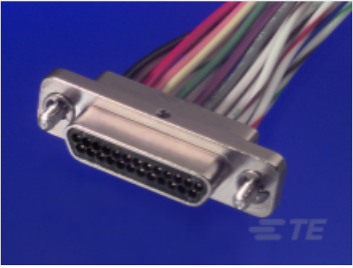
TE Part # 3-1532171-1 M83513/04-A15C, MCKS-C2-B-9S6Q1-72.0