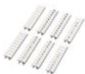
Zack marker strip, Can be ordered: Strip, white, Labeled according to customer specifications, Mounting type: Snap into tall marker groove, For terminal block width: 3.5 mm, Lettering field: 3.5 x 10.5 mm

Zack marker strip - ZB 3,5 CUS - 0829415