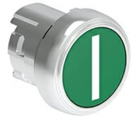
Pushbutton actuators, spring return, with symbol LPSB11