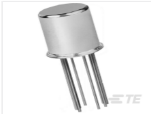
TE Part #1-1617119-9 J1MAWD-5XM = M39016/23-013M