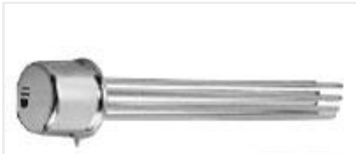
TE Part #3-1617118-1 J1MACDD-26XM = M39016/24-030M