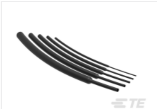
TE Part #NB19642001 RNF-100-3/32-BK-STK