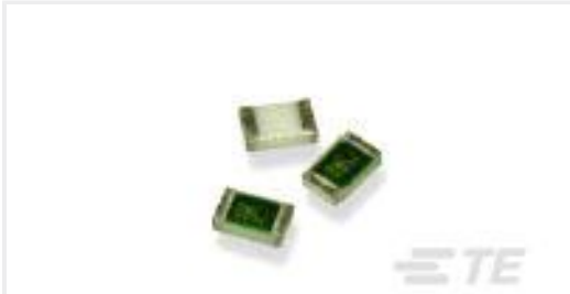
TE Part #2-1879216-9 CPF0402 110K 0.1% 25PPM 1K RL