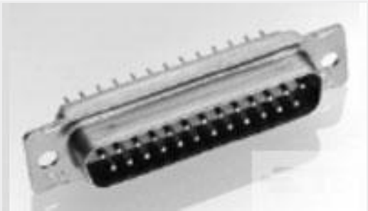
TE Part #1757828-2 AMPLIMITE,RCPT ASY,POSTD,109,ZN, 2