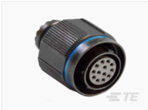
TE Part #YDTS26W25-29PAV001 PLUG ASSY