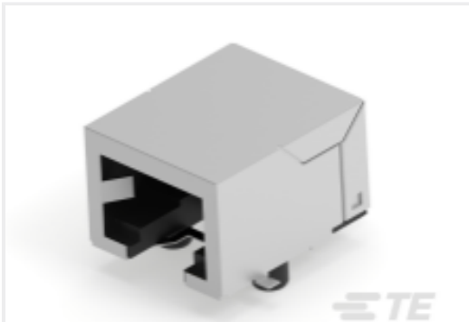
TE Part #133611-E MJ LSS ** 8 8 *** STP * 30 * J 3 2034