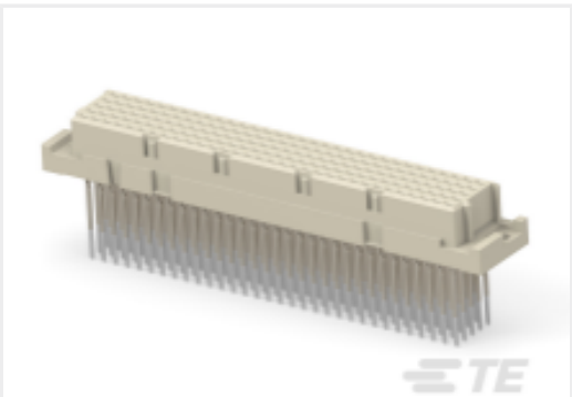
TE Part #254960-E STVE 160 F ABCDE VVVV 7-00 EEUE 17,0 *