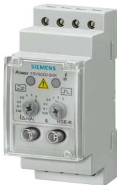
RESIDUAL CURRENT MONITOR ANALOG, TYPE A IDN 0,03A 5A 0,02 5 SEC