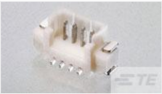
TE Part #1-1734260-4 1.25 WTB HDR SMT, 14 POS