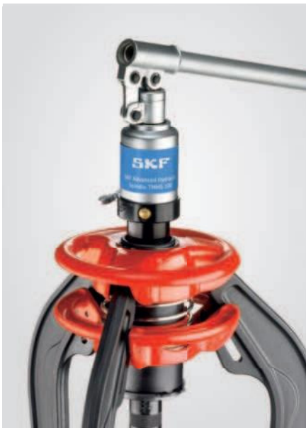
TMHS 100 shown as part of hydraulic puller TMMA 100H