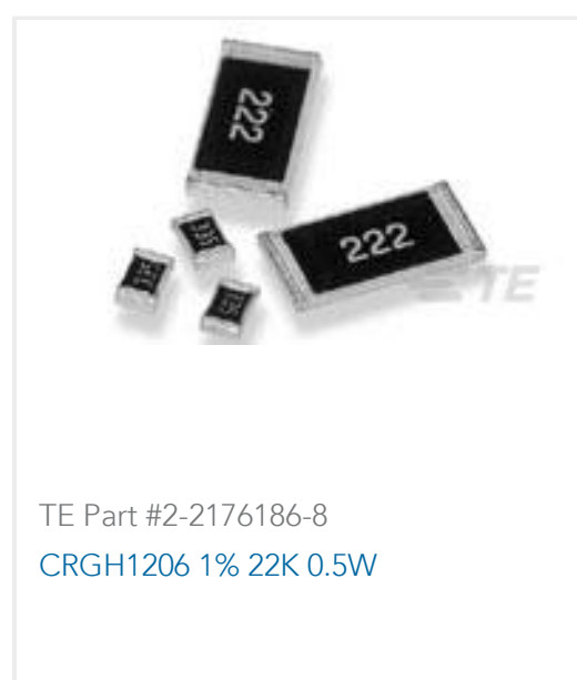
TE Part #2-2176186-8 CRGH1206 1% 22K 0.5W