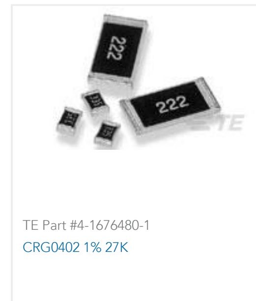
TE Part #4-1676480-1 CRG0402 1% 27K