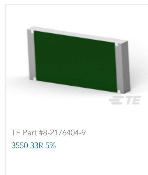
TE Part #8-2176404-9 3550 33R 5%