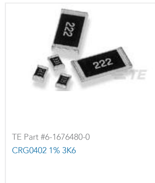
TE Part #6-1676480-0 CRG0402 1% 3K6