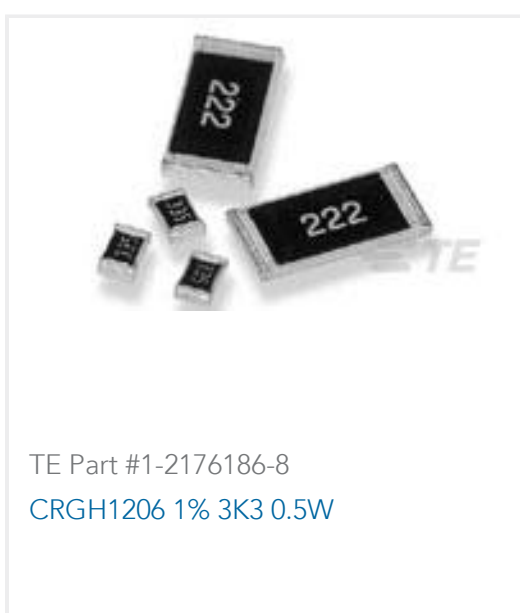
TE Part #1-2176186-8 CRGH1206 1% 3K3 0.5W