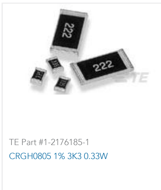
TE Part #1-2176185-1 CRGH0805 1% 3K3 0.33W