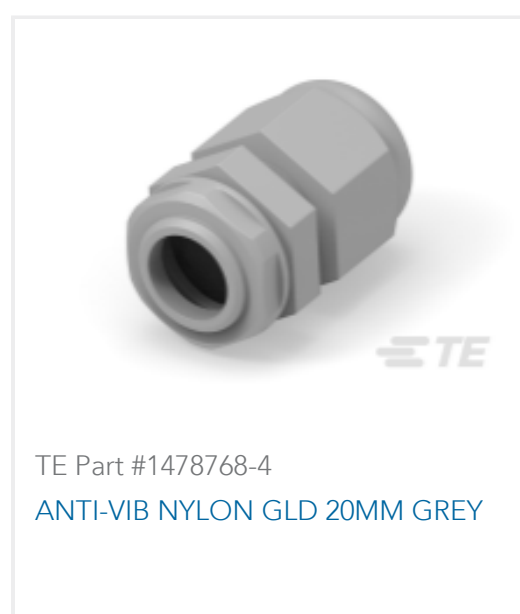
TE Part #1478768-4 ANTI-VIB NYLON GLD 20MM GREY