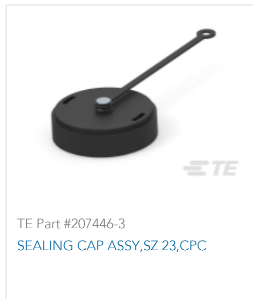
TE Part #207446-3 SEALING CAP ASSY,SZ 23,CPC