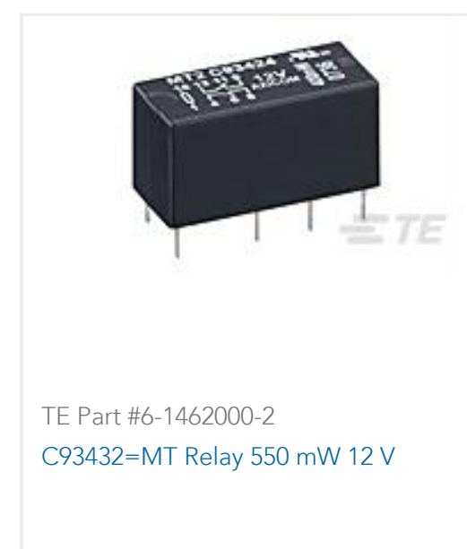
TE Part #6-1462000-2 C93432=MT Relay 550 mW 12 V