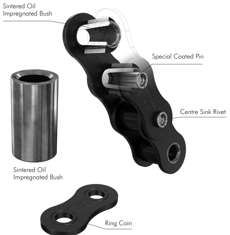
Fig. 10 Basic Construction

Standard BS roller chain sprockets can be used. However, due to the extended lifetime of BS LAMBDA chain, TSUBAKI recommends to install sprockets with hardened teeth in every LAMBDA application.