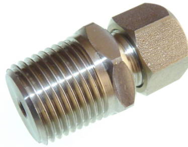
(BSPT tapered example – 286-787, see below for other sizes)