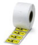
Label, yellow/black, labeled, can be labeled with: THERMOMARK ROLL, THERMOMARK ROLL X1, THERMOMARK X1.2: Lightning flash, Mounting type: Adhesive, Lettering field: 51 x 25 mm