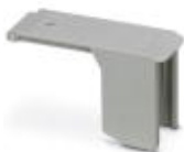
Covering hood, Connection method: Bolt connection, Width: 54.8 mm, Height: 33 mm, Color: gray