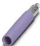
Female test connector, color: violet

Female test connector - PSBJ-URTK 6 VT - 3026421