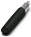
Female test connector, color: black

Female test connector - PSBJ-URTK 6 BK - 3026447