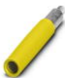
Female test connector, color: yellow

Female test connector - PSBJ-URTK 6 YE - 3026405