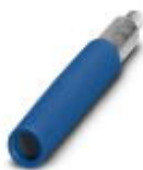
Female test connector, color: blue

Female test connector - PSBJ-URTK 6 BU - 3026434