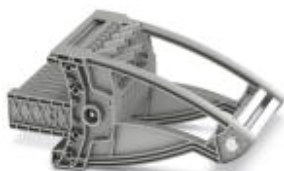
The figure shows version

Test plug, number of positions: 11, connection method: Screw connection, color: gray