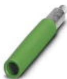
Female test connector, color: green

Female test connector - PSBJ-URTK 6 GN - 3026418