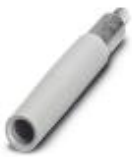
Female test connector, color: white

Female test connector - PSBJ-URTK 6 WH - 3026448