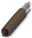
Female test connector, color: brown

Female test connector - PSBJ-URTK 6 BN - 3026971