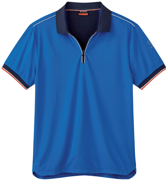
■ 1452 POP BLUE