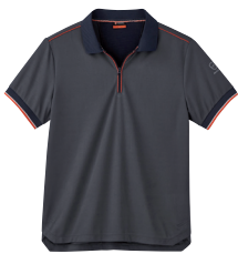
■ 1453 PARADE GREY