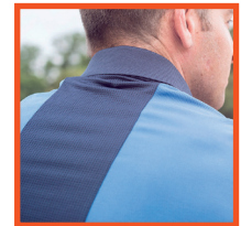
BREATHABLE MESH INLAY