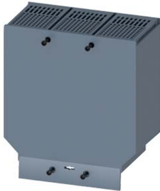
terminal cover offset 3-pole 1 unit accessory for: 3VA2 100/160/250