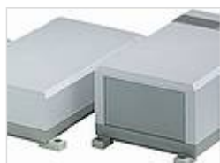
Wall brackets, ABS