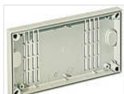
Covers for keyhole suspension