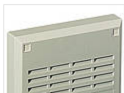
Screw cover, ABS