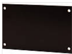
Mounting panel, laminated paper