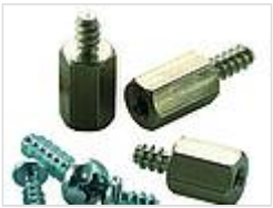
Screws (SHR) and distance bolts (DIBLZ) for mounting bosses in plastic enclosures