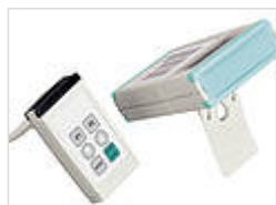
Universal clip and tip-up clip