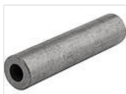
Press-in tool for EG-SV