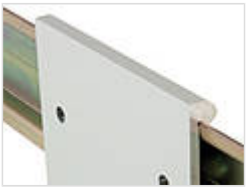
Metal top hat rail adapter for DIN rail DIN EN 60715 TH 35