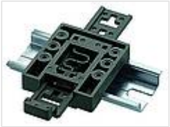
Universal DIN rail holder TSH 35, polyamide