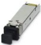
Gigabit SFP module for transmission up to 1 km with a wavelength of 850 nm.