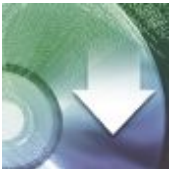
License for mGuard Secure VPN Client v11.x

License - MGuard SECURE VPN CLIENT LIC - 2702579