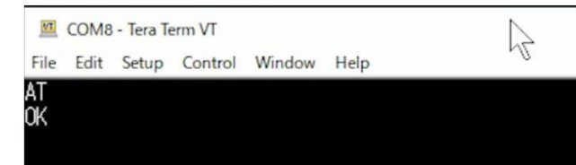
Figure3: Tera Term Command Window