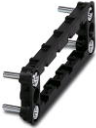
Panel mounting frame, without PE, for contact insert modules, type 4, number of insert modules 5, without screws

Please be informed that the data shown in this PDF Document is generated from our Online Catalog. Please find the complete data in the user's documentation. Our General Terms of Use for Downloads are valid ( http://phoenixcontact.com/download )