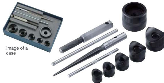
Image of a case