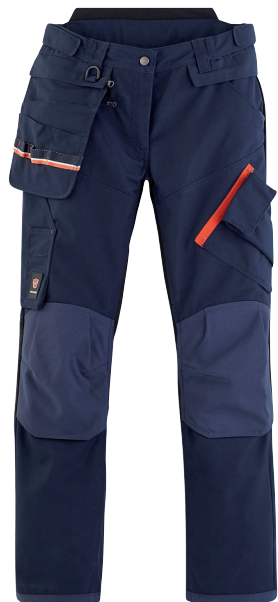
■ 1792 PARADE BLUE