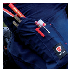
Tape measure pocket