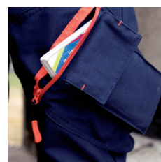
Map and phone pocket