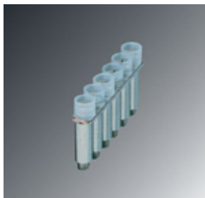
Fixed bridge, Number of positions: 6, Color: silver

Please be informed that the data shown in this PDF Document is generated from our Online Catalog. Please find the complete data in the user's documentation. Our General Terms of Use for Downloads are valid ( http://phoenixcontact.com/download )